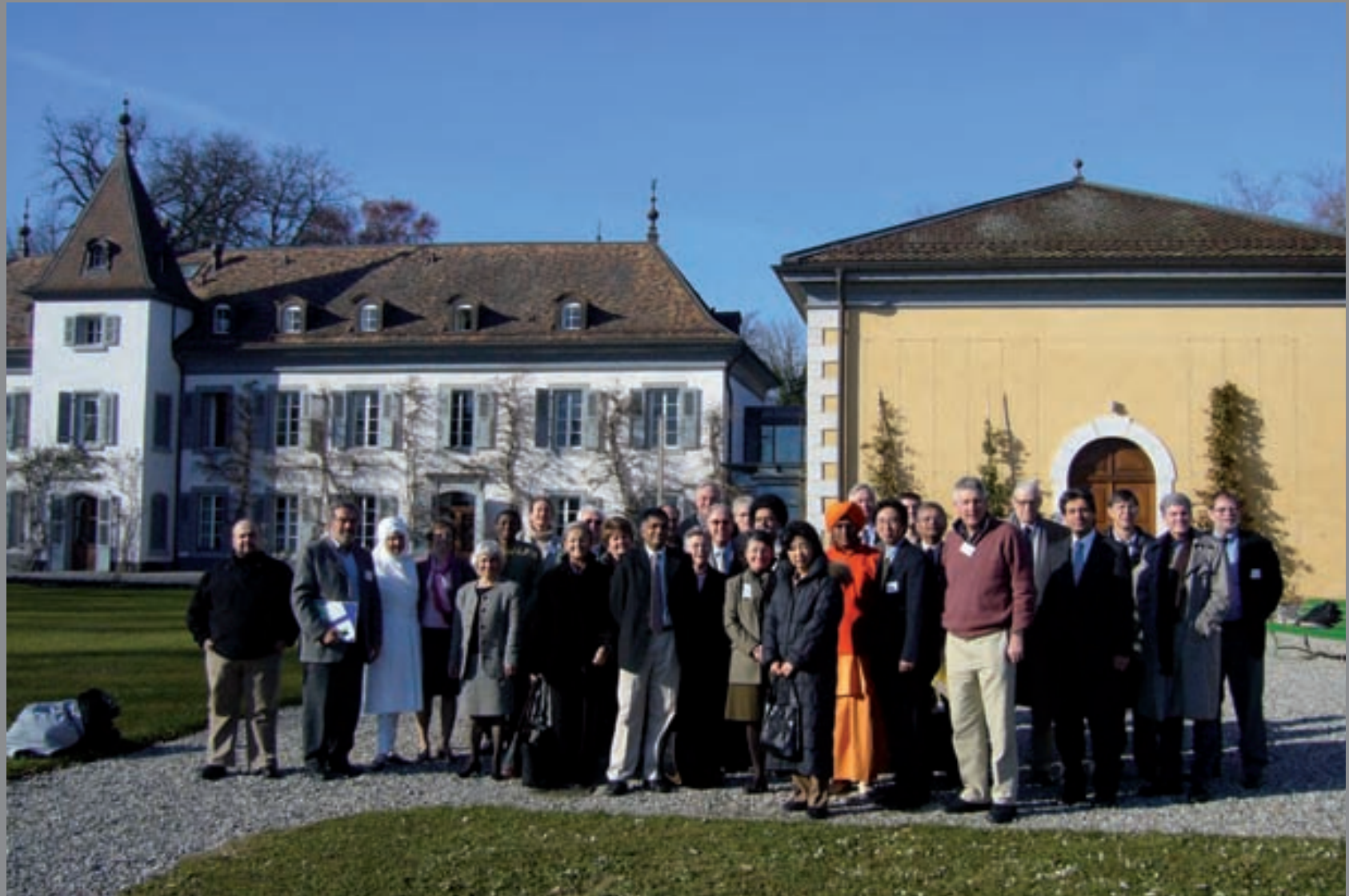
Launching of the DECADE Initiative Chateau de Bossey, Geneva, January 2008