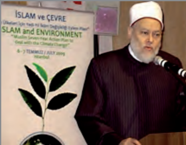
Sheikh Ali Goma'a, The Grand Mufti of Egypt, speaking at the historic meeting in Istanbul